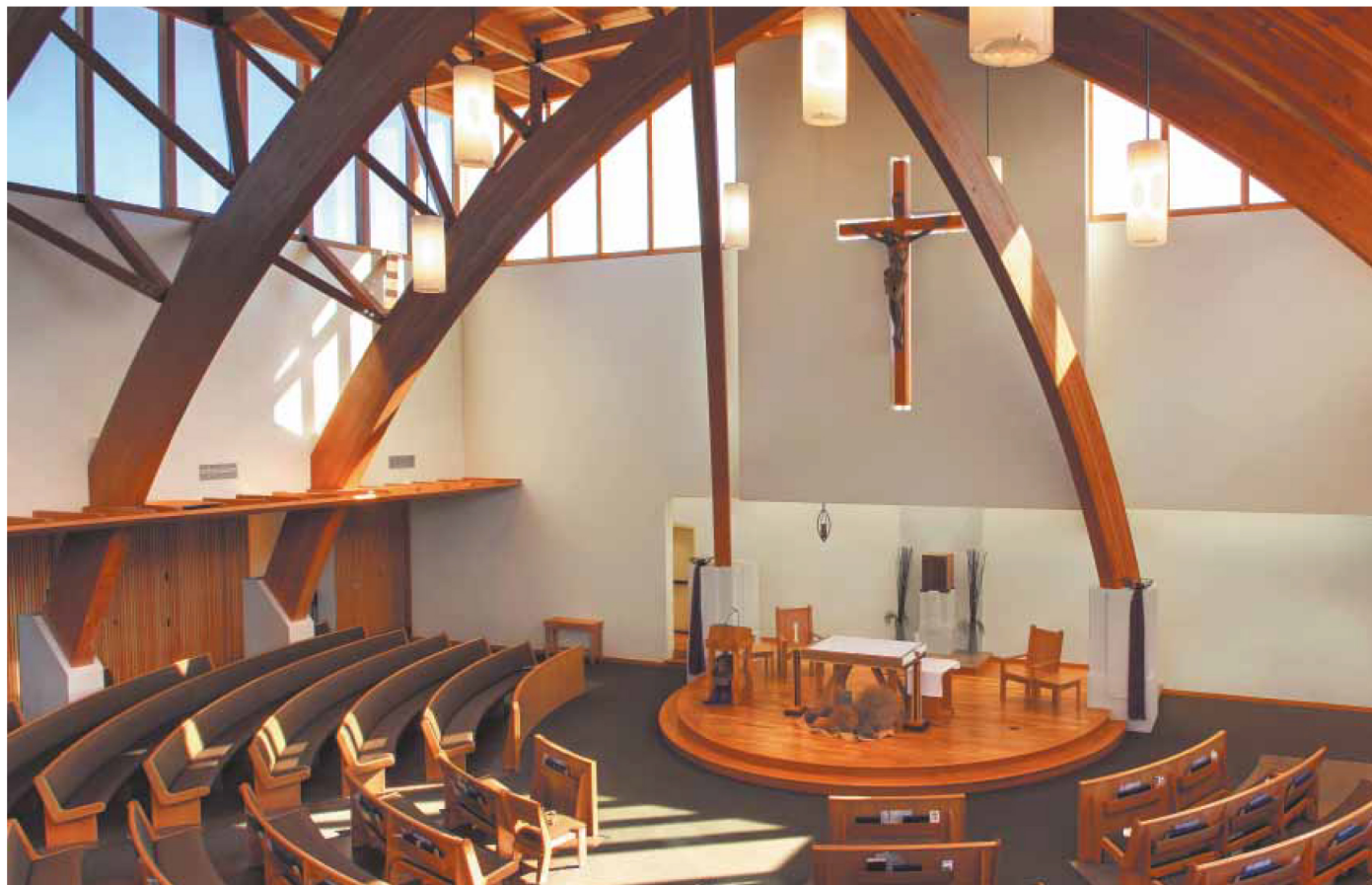
The interior of St Edward Catholic Church, with the altar.

Arguably a product of faith and prayer, St Edward Catholic Church is a beacon of light to the faithful, lifting the spirits of those who look upon it.